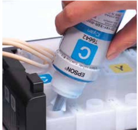
Smart tip design for easy, mess-free refills

The L1800 supports printing to a wide variety of printing media from 4R photo prints all the way up to A3+ sizes, allowing you to accomplish all your printing jobs, from the simplest to the most demanding.