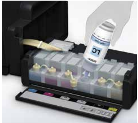
Specially fitted tubes ensure reliable ink flow without leakage

Epson's original ink tank system is engineered for easy, mess-free refills. The special tubes in the printer are designed to ensure smooth and reliable ink flow at all times.